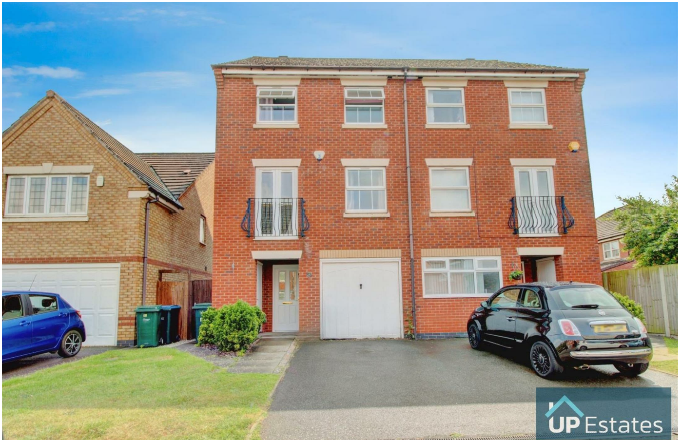
Valencia Road, Coventry